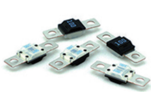
Clear MIDI® Fuses (transparent nylon composite cover)