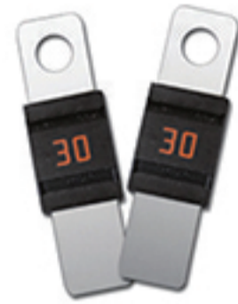
One Hole MIDI® Fuses